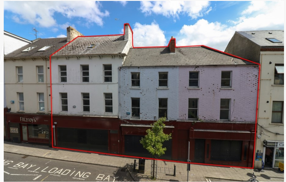
15 Carlisle Rd