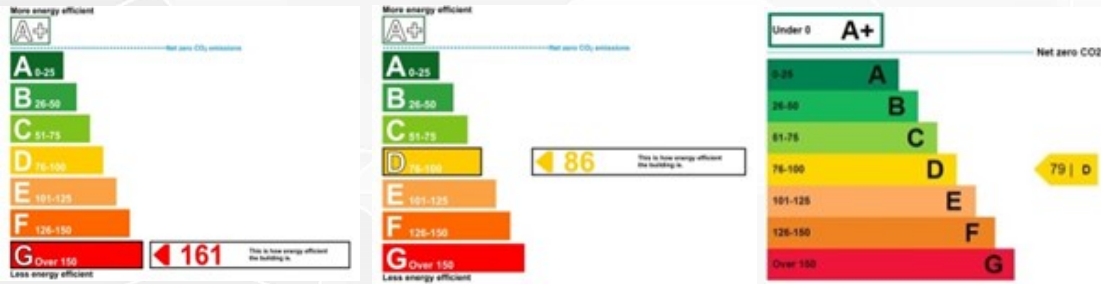
5-9 Carlisle Road