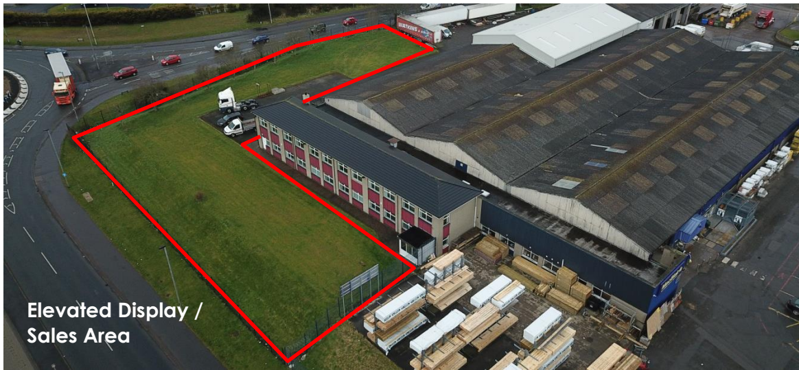
Elevated Display / Sales Area